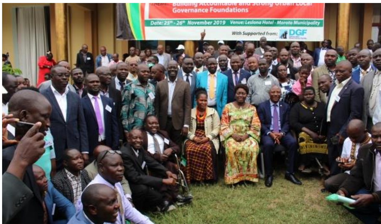
The Speaker of Parliament, Hon. Rebecca Kadaga with urban leaders at the 8 th Urban Leaders Forum and 17 th Annual General Meeting; Leslona Hotel, Moroto Municipality