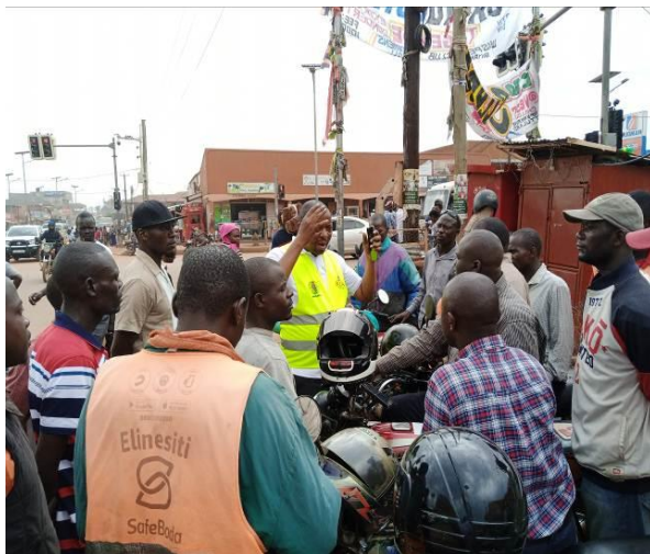
The Mayor of Kawempe Division, sensitizing boda boda riders about HIV