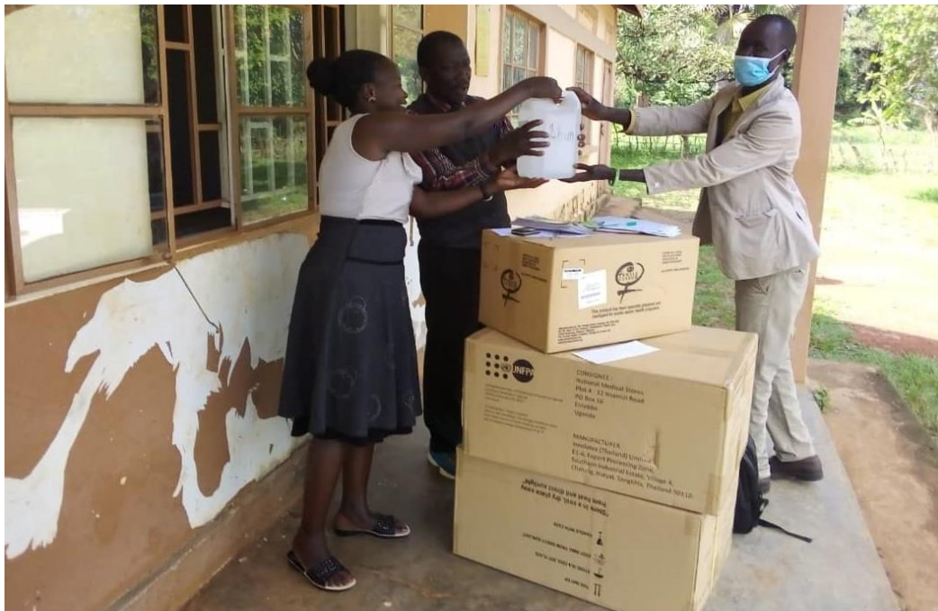
AMICAALL Project Officer (cream suit) handing over condoms, gloves, sanitizer to Abim Town Council leaders