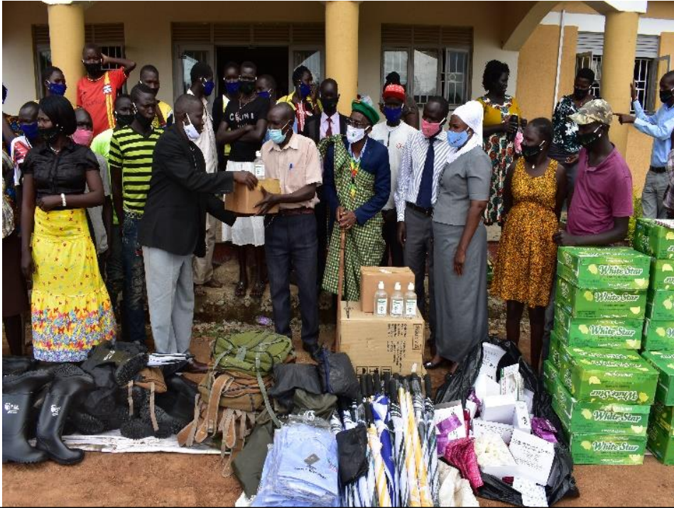
AMICAALL Team handing over work aids for Peer Educators to Kotido Municipality Leadership. Looking on are peer educators.