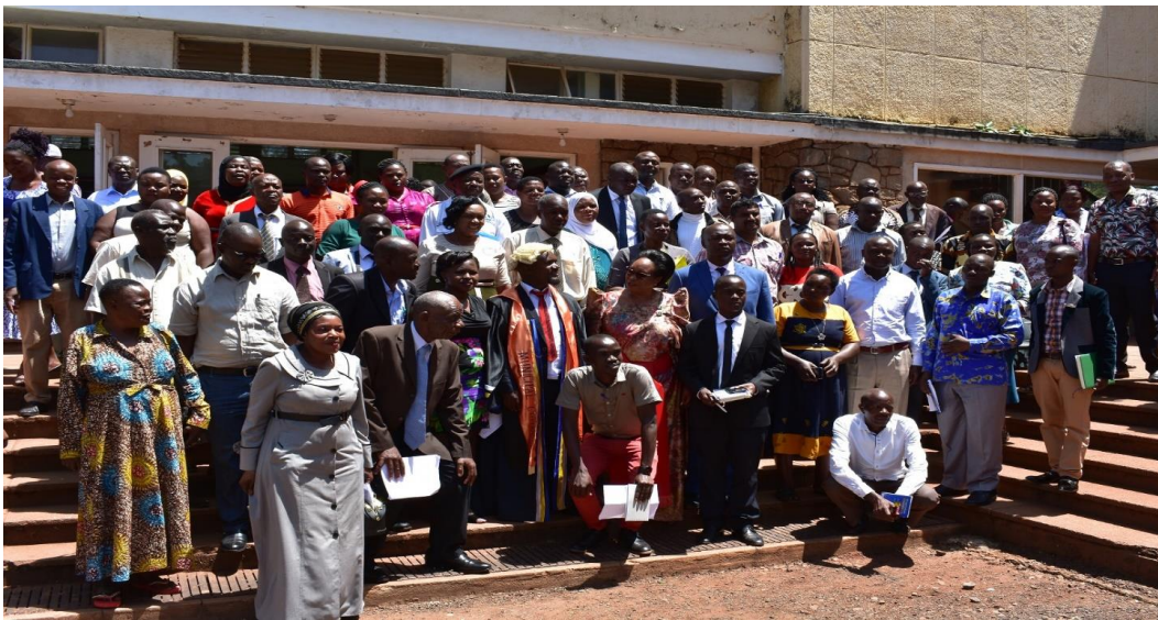
Leaders of the project UAs after witnessing the Jinja Municipal Council proceedings during the peer learning visit.