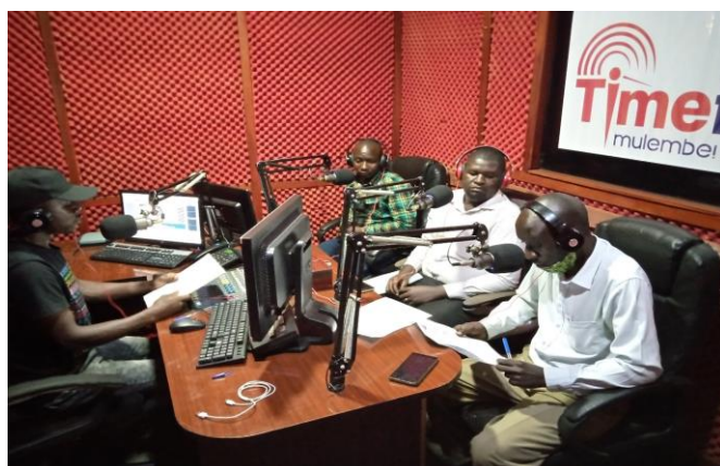
Nauyo -Bugema Town council Leaders sensitizing the masses and providing accountability on service delivery.