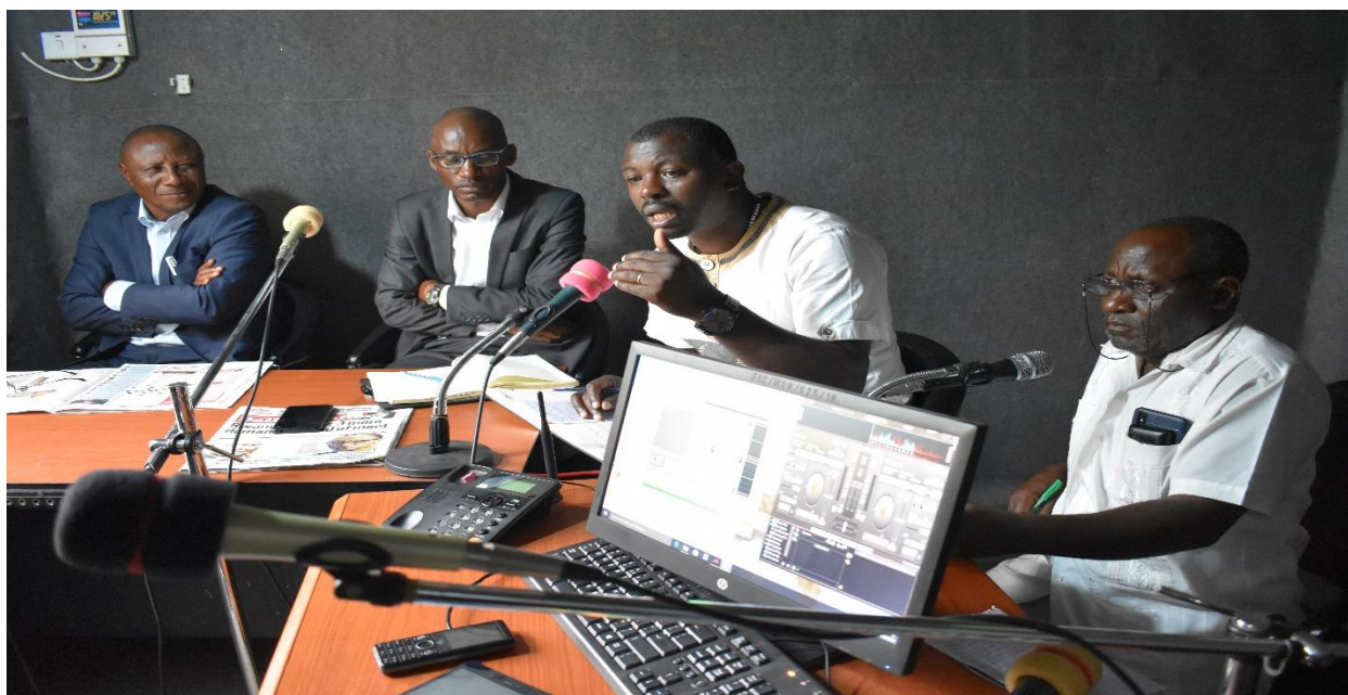
The Kasese Resident State Attorney (white T shirt) discussing HIV and Human rights matters on UBC ngeye FM, in Kasese Municipality. Looking on (extreme left) AMICAALL Chairman and AMICAALL Country Director