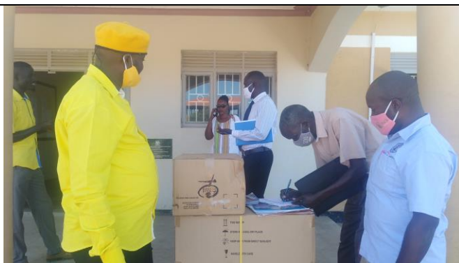
With support from UNFPA/AIC, Mayor of Kotido Municipal Council (in yellow) received condoms and IEC materials on HIV, SRH and GBV