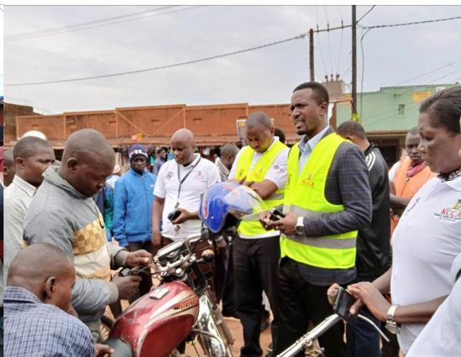
The Kawempe Division Resident Commissioner sensitizing boda boda riders and truck drivers about HIV