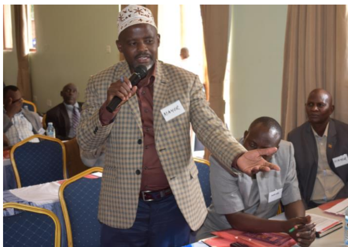
The Mayor of Kigumba Town Council sharing his views on governance and service delivery during the leaders forum and AGM