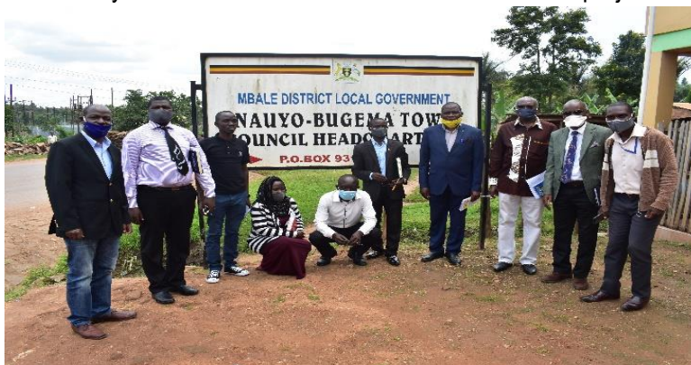
The Commissioner of MoLG (Brown shirt), AMICAALL board member (grey coat) AMICAALL staff and urban authority leaders during the national joint monitoring visit in Nauyo – Bugema Town Council in Mbale City