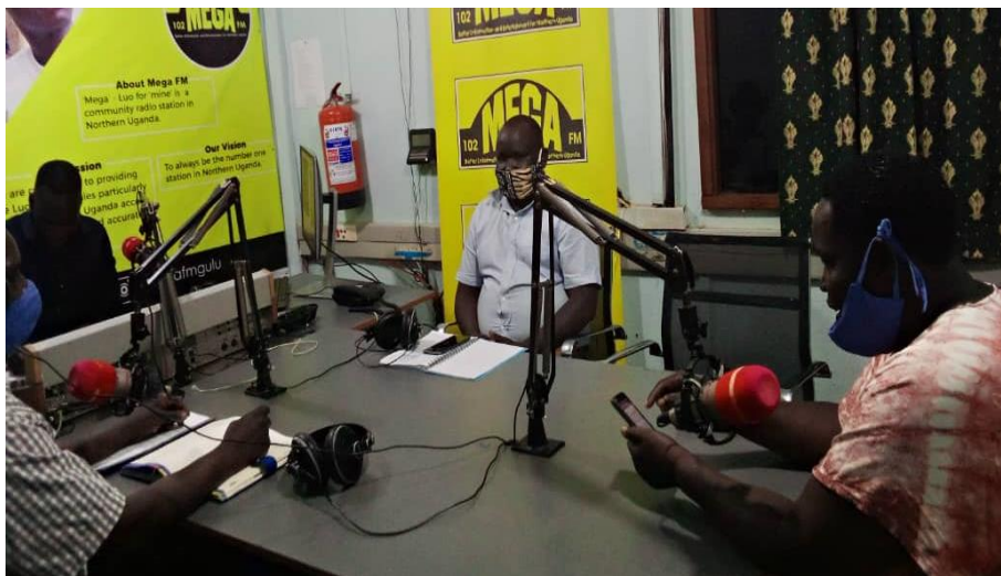
The urban leaders of Gulu City sensitizing the urban communities about HIV/GBV/SRH during a radio Talk show

a) With funding from SIDA through UNFPA and AIC, AMICAALL Uganda supported the leadership of 18 Urban Authorities to conduct SRH/HIV/GBV integrated campaigns. 57 radio talk shows in the period between June –July 2020 with an average of 5 panelists each (elected and technical leaders of urban authorities like the mayors, DHOs, Town clerks, Community Developments officers, Resident District Commissioners, District Health Educators among others). Talking points and radio spot messages were developed, shared with the panelists and each team held 2 radio talk shows focusing on why it is critically important to ensure continuity of SRH, GBV and HIV/AIDS interventions among Key and Vulnerable Populations during COVID 19 pandemic . The urban authorities included Abim, Kotido, Moroto, Napak, Nakapiripirit, Kaberamaido, Amuria, Gulu, Pader, Yumbe, Bundibugyo and KCCA 5 Divisions of Makindye, Lubaga, Nakawa, Central, Kawempe among others and reached 13,729,000 million people. The radio stations included Mega FM Gulu, Youth FM Amuria, Kumaamu Broadcasters Kabermaido, Palwak FM Pader, UBC Bundibugyo, Ribat FM in Yumbe, Kiyandongo media services, Etoil Akaramajong (voice of Karamoja) for Kaabong, Kotido, UBC radio in Moroto, Metro 90.8 FM for Makindye Division, Akaboozi 87.9 for Lubaga Division, Star FM for Nakawa division and Bilal Radio for Central division in Kampala.