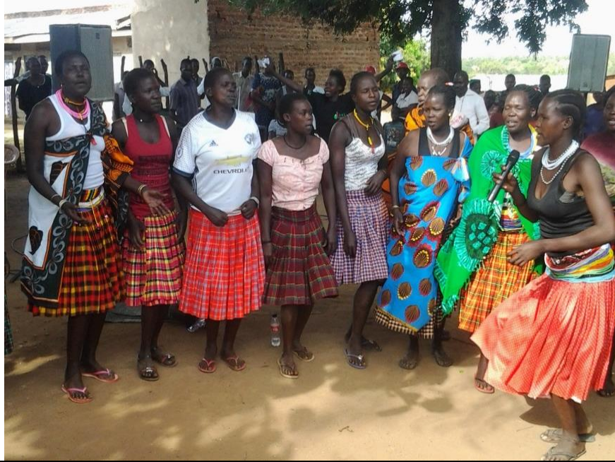
Drama group of Nakapiripirit TC sharing information as well as mobilizing people to an outreach camp on HTS and STI screening