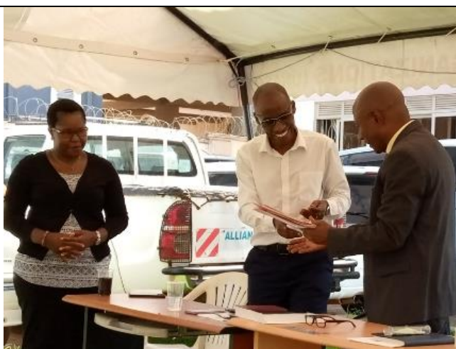
Former Country Director (m), handing over to the AMICAALL Chairman (R), on the left is Acting Country Director