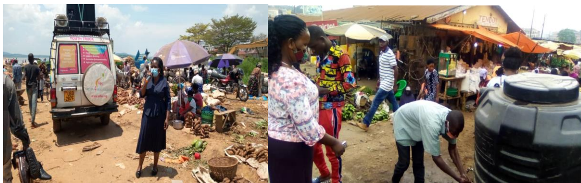
KCCA Official (L) giving HIV, TB and COVID – 19 messages and (r) members of the community adhering to the COVID -19 SOPs by washing handing