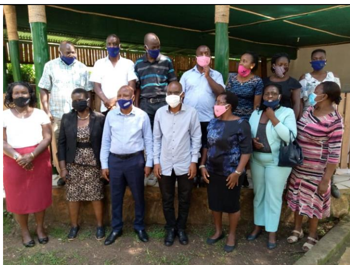
AMICAALL staff at the 2020 programme review meeting in Jinja