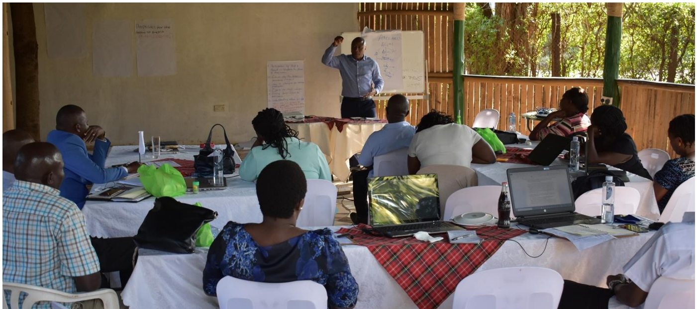
The Alliance Executive Council (AEC) Chairman discussing the board governance with staff

a) Joint project performance review: With support from DGF, AMICAALL organized a joint review of its governance project performance. The review included the entire programme review as well. This was held in September 2020 and the organization's staff were able to reflect on the achievements and challenges as well as the practical; solutions. The review was joined by the AEC chairman and Honorary Treasurer who participated in the future plans for the organization.