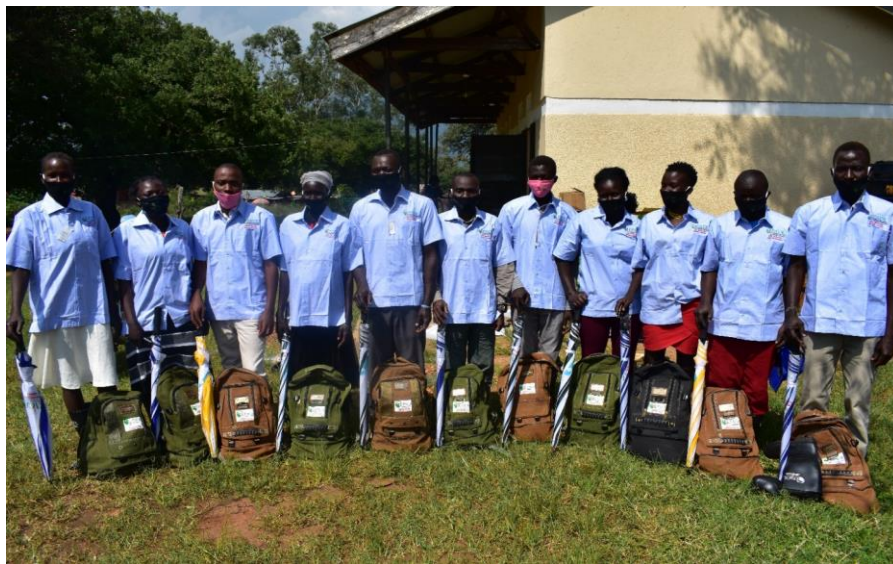
Peer Educators from Nakapiripirit Town Council after receiving work aids from AMICAALL